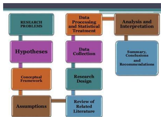
Figure 3: Conceptual Framework on the Research Procedural Steps